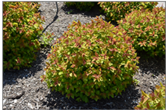
Double Play Big Bang Spirea