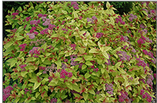
Magic Carpet Spirea flowers