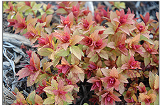
Magic Carpet Spirea foliage