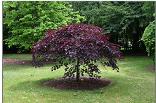
Ruby Falls Redbud

Ruby Falls Redbud will grow to be about 8 feet tall at maturity, with a spread of 6 feet. It has a low canopy with a typical clearance of 1 foot from the ground, and is suitable for planting under power lines. It grows at a medium rate, and under ideal conditions can be expected to live for 60 years or more.