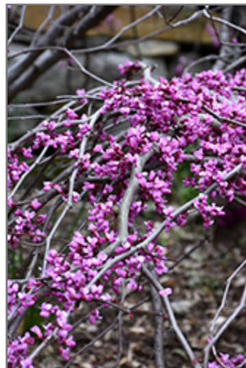
Ruby Falls Redbud flowers