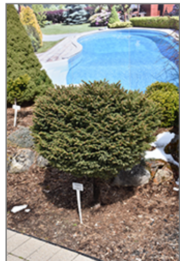
Little Gem Spruce (tree form)