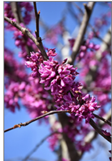
Eastern Redbud (tree form) flowers