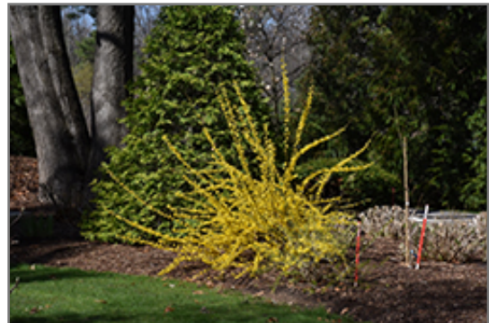
Show Off Forsythia in bloom