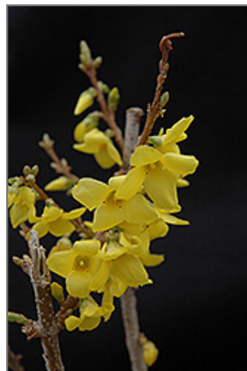
Show Off Forsythia flowers

Show Off Forsythia makes a fine choice for the outdoor landscape, but it is also well-suited for use in outdoor pots and containers. With its upright habit of growth, it is best suited for use as a 'thriller' in the 'spiller-thriller-filler' container combination; plant it near the center of the pot, surrounded by smaller plants and those that spill over the edges. It is even sizeable enough that it can be grown alone in a suitable container. Note that when grown in a container, it may not perform exactly as indicated on the tag - this is to be expected. Also note that when growing plants in outdoor containers and baskets, they may require more frequent waterings than they would in the yard or garden.