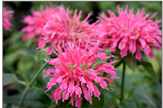
Coral Reef Beebalm flowers