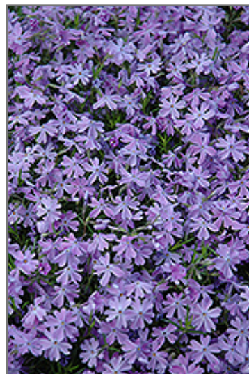
Emerald Blue Moss Phlox flowers

Emerald Blue Moss Phlox is recommended for the following landscape applications;