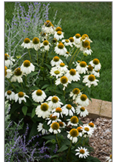
PowWow White Coneflower in bloom