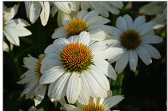
PowWow White Coneflower flowers

PowWow White Coneflower is an herbaceous perennial with an upright spreading habit of growth. Its medium texture blends into the garden, but can always be balanced by a couple of finer or coarser plants for an effective composition.