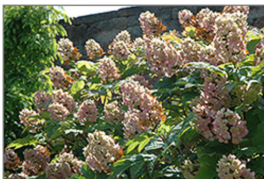
Snow Queen Hydrangea flowers