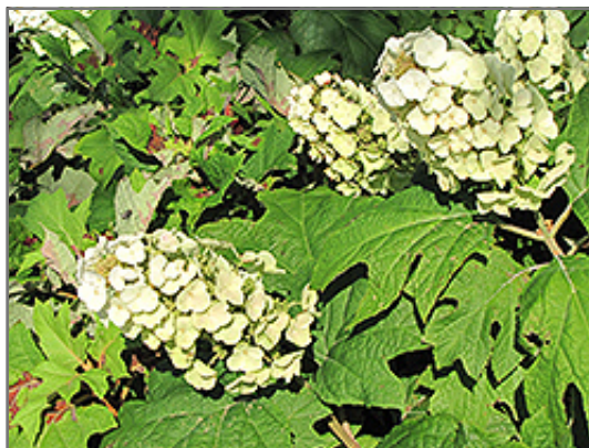
Snow Queen Hydrangea flowers

This shrub performs well in both full sun and full shade. It prefers to grow in average to moist conditions, and shouldn't be allowed to dry out. It is not particular as to soil type or pH. It is somewhat tolerant of urban pollution, and will benefit from being planted in a relatively sheltered location. Consider applying a thick mulch around the root zone in winter to protect it in exposed locations or colder microclimates. This is a selection of a native North American species.