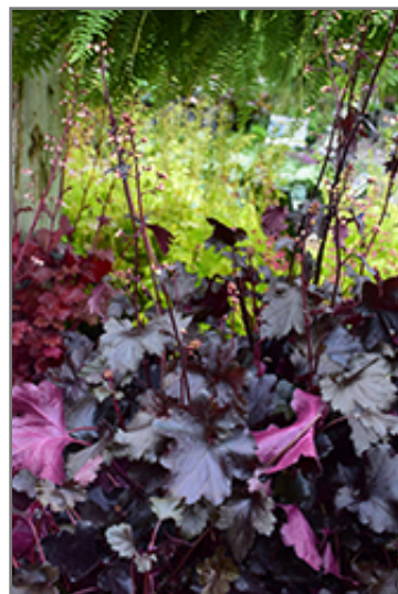
Black Pearl Coral Bells in bloom

This is a relatively low maintenance plant, and should be cut back in late fall in preparation for winter. It is a good choice for attracting hummingbirds to your yard. It has no significant negative characteristics.