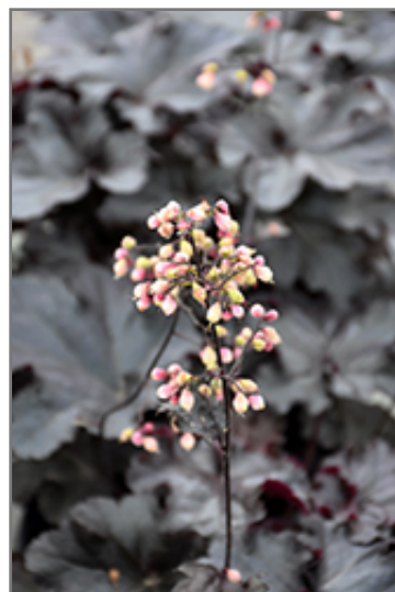
Black Pearl Coral Bells flowers