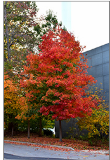
Fall Fiesta Sugar Maple in fall

Fall Fiesta Sugar Maple is recommended for the following landscape applications;