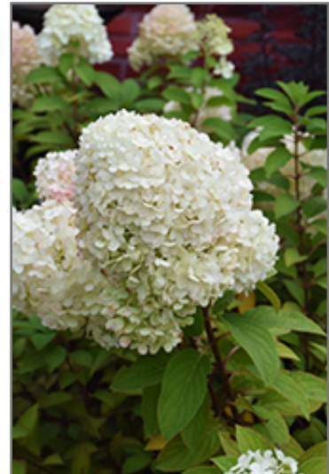
Bobo Hydrangea flowers